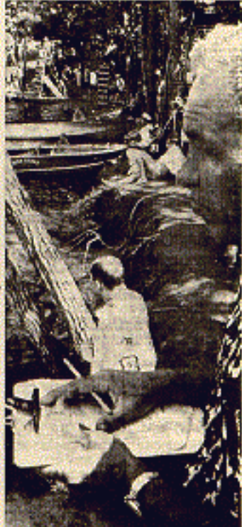
EXPERIENCED OBSERVER —A Wisconsin slalom slalom and judge from Wisconsin Rapids, watches the slalom event Sunday at Lake Wisconsin. One of three observers on scene. The other two are in the background.