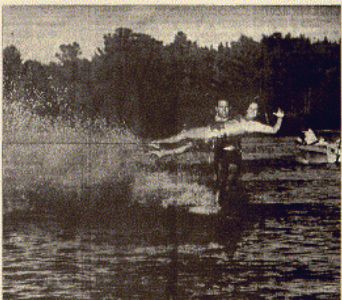
PLACE IN DOUBLE ACT —Placing third in mixed slalom competition with Don Rippe and Sandy Elliott, both were

WISCONSIN RAPIDS DAILY TRIBUNE Friday, August 28, 1964 Page 5